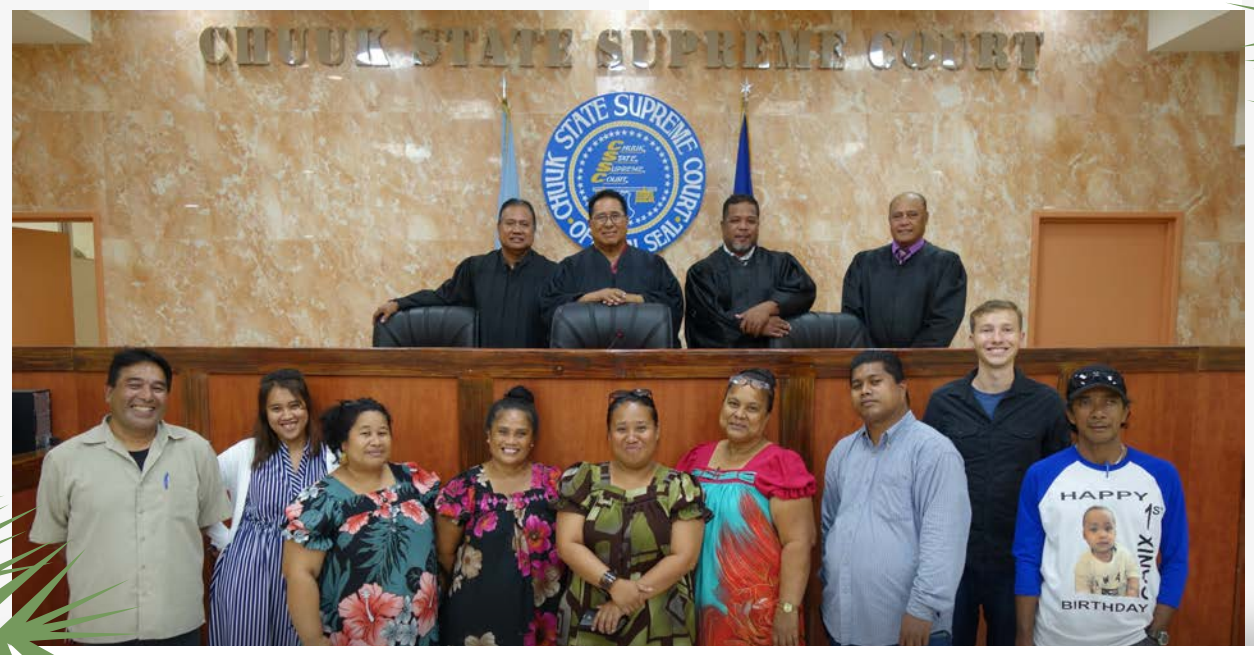
Pictured: Chuuk State Supreme Court Judicial Officers and Staff