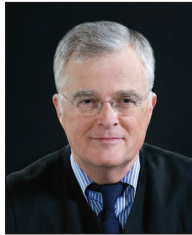
Written by District Judge William J. Alsup of San Francisco

Judge Lamorena also implemented the first automation system at the Guam Judiciary — the AS400 case-management system — and established a government-wide criminal justice information system allowing law enforcement agencies access to the court’s criminal records. He also set up a direct link with the FBI’s National Crime Information Center, permitting law enforcement in the U.S. territory access to the FBI criminal database.